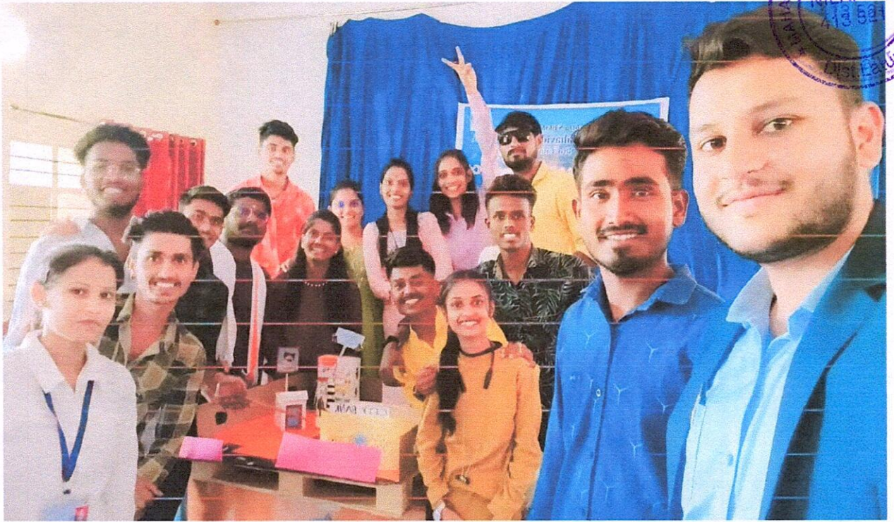
Bank Model demonstration activity organized by Dept. Of Commerce