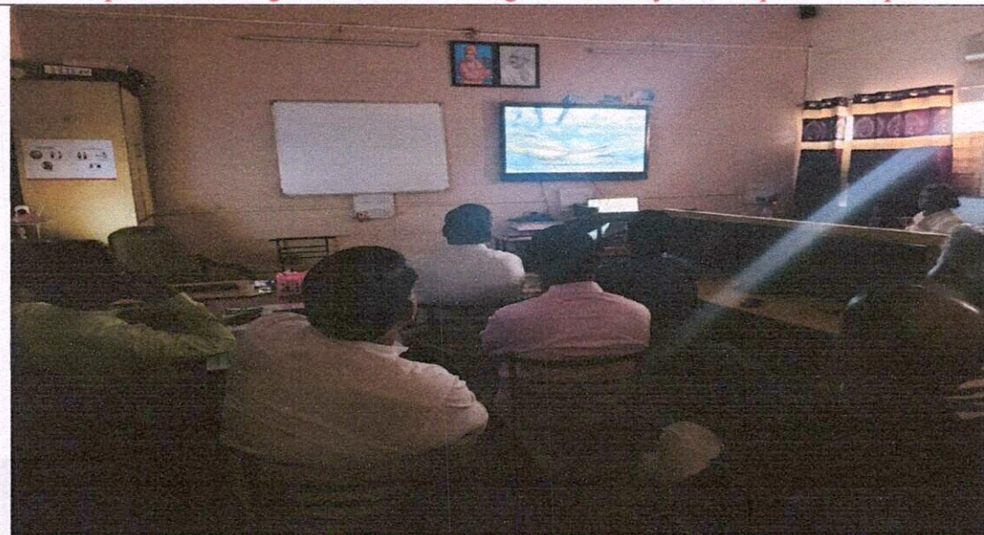
A special screening of the Oscar winning documentary The Elephant Whisperers