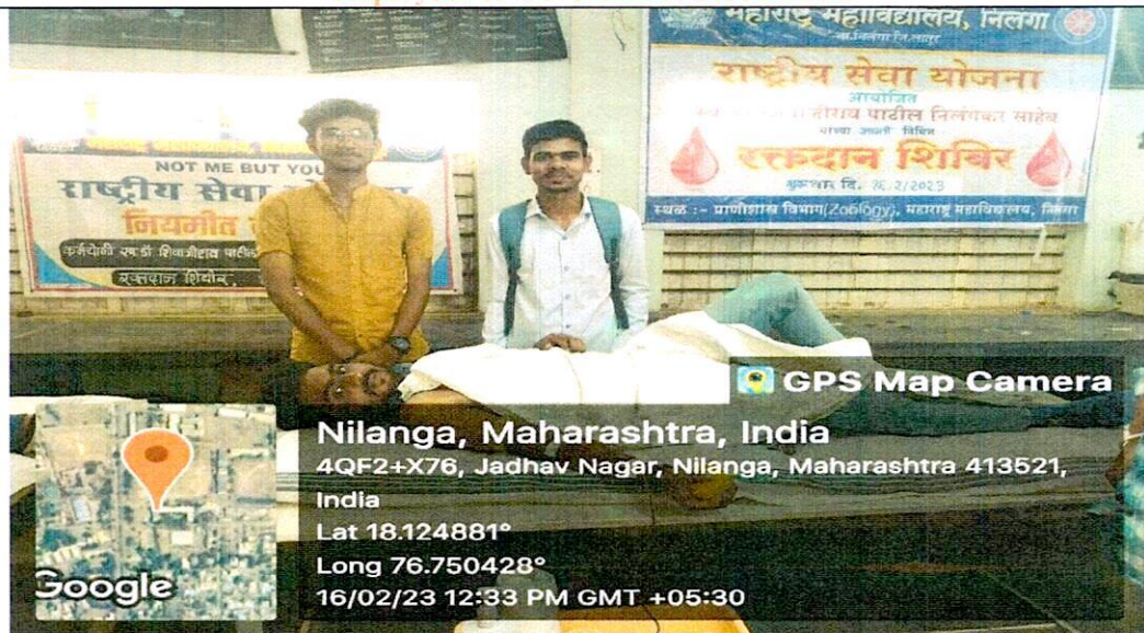
Dignitaries present during volunteer blood donation of National Service Scheme and employees of Government Blood Bank