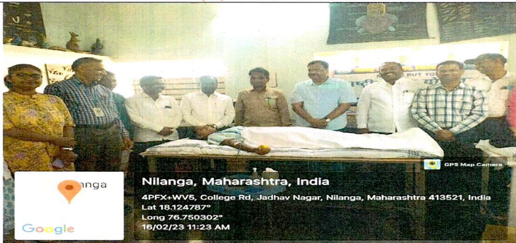
Hon'ble Vijaykumar Patil Nilangekar and other dignitaries present while welcoming the doctors and employees of the Government Blood Bank

4PFX+WV6, College Rd, Jadhav Nagar, Nilanga, Maharashtra 413521, India Lat 18.124788° Long 76.750321° 16/02/23 11:17 AM