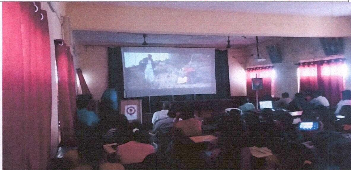
Moments of Film Appreciation Workshop