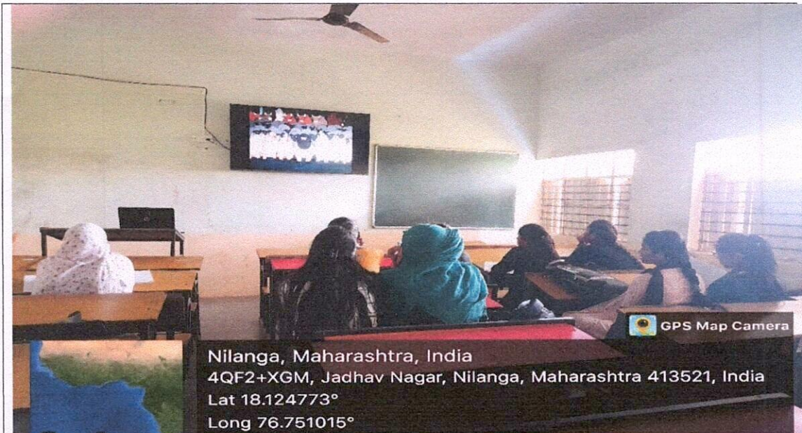
Screening of the animated film Animal Farm