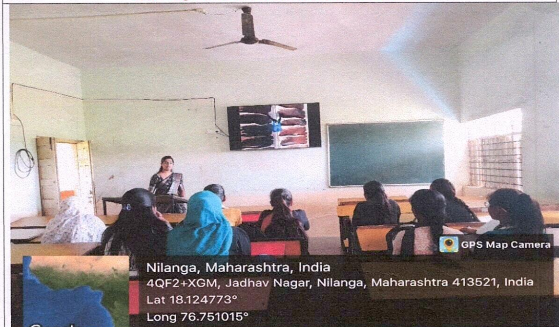
'Screening of Animal Farm'