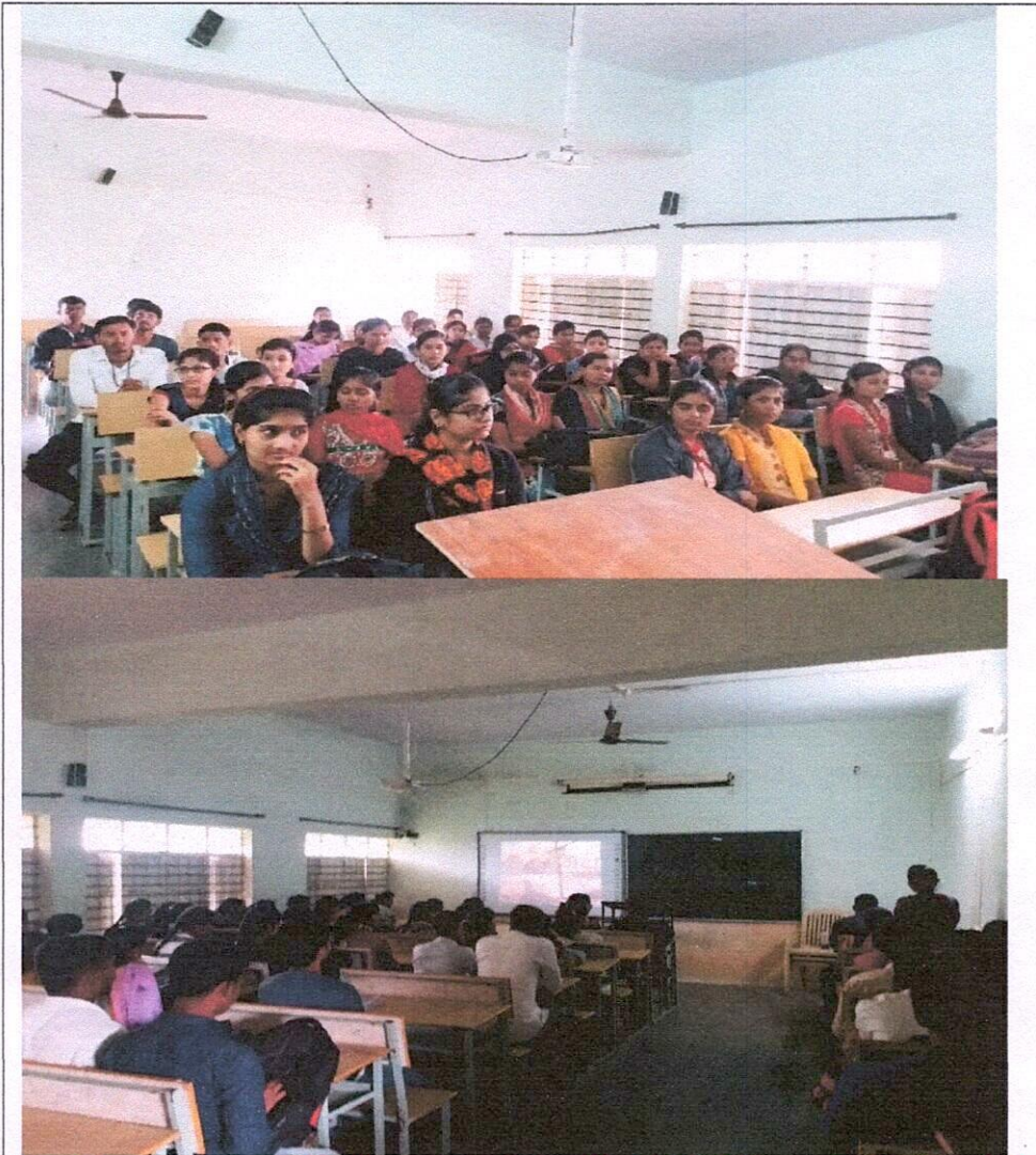
An Occurrence at Owl creek Bridge Part-II College students while acquiring various skills