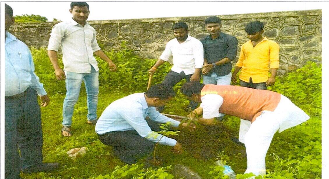
During the cleanliness drive and tree planting in the college premises on the occasion of Republic Day