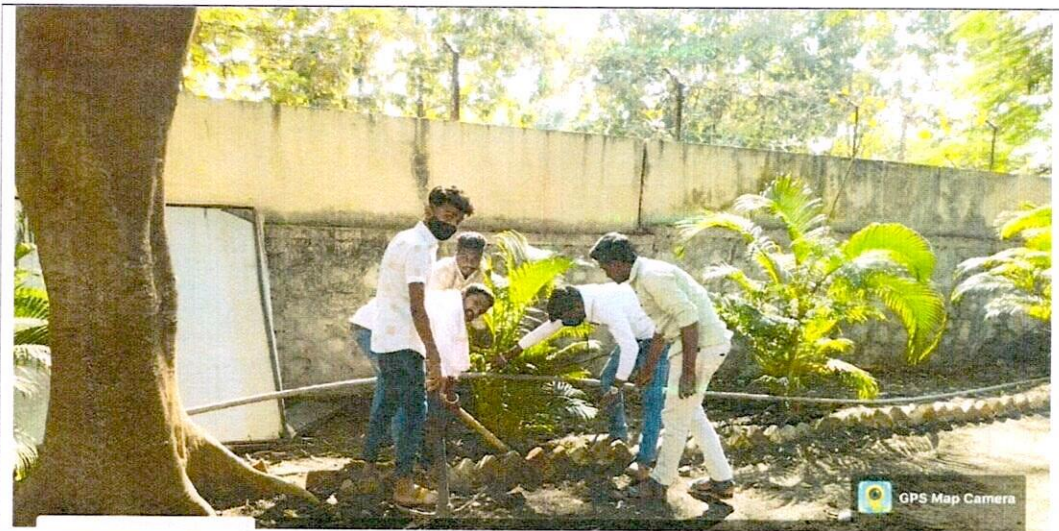
On the occasion of tribal leader Birsa Munda's birth anniversary, a cleanliness campaign was conducted in the college premise.