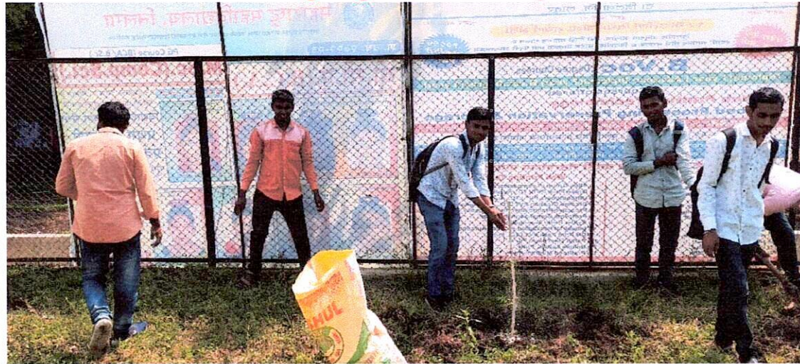
Students giving Fertilizer to the plants