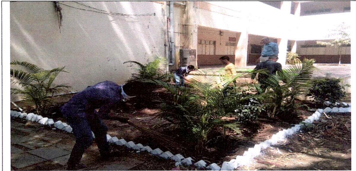
Student of NSS participated in the college cleaning campaign