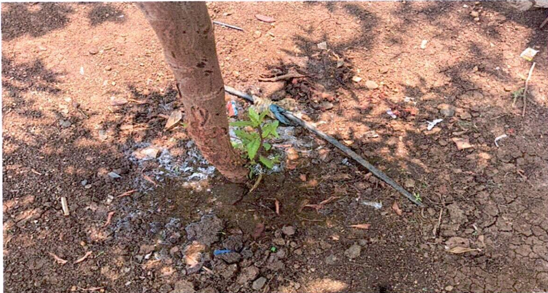
Drip irrigation System