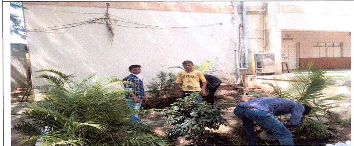
NSS student participated in cleaning campus