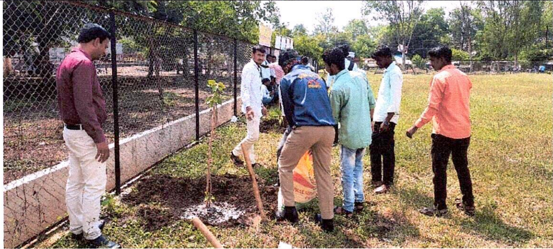
Students giving Fertilizer to the plants