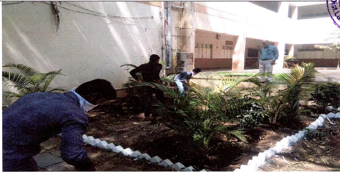
Principal of the college while implementing cleanliness program through practical action to inculcate interest in cleanliness among the college students