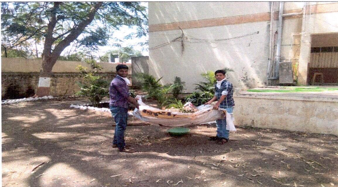
Collection of organic waste NSS students in premises