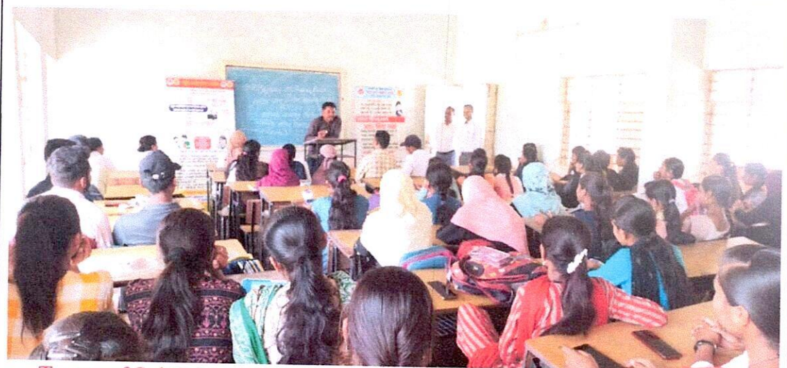
Teams of Sub District Hospitals in guidance regarding Infectious Diseases