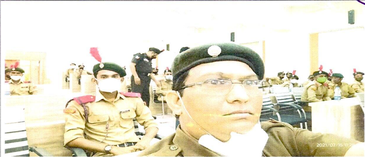
While congratulating the students on behalf of the Latur Collector, taking note of the work of the college students