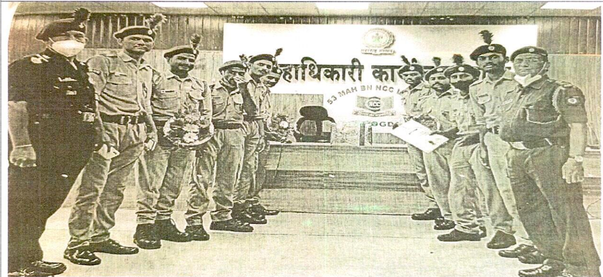
While congratulating the students on behalf of the Latur Collector, taking note of the work of the college students