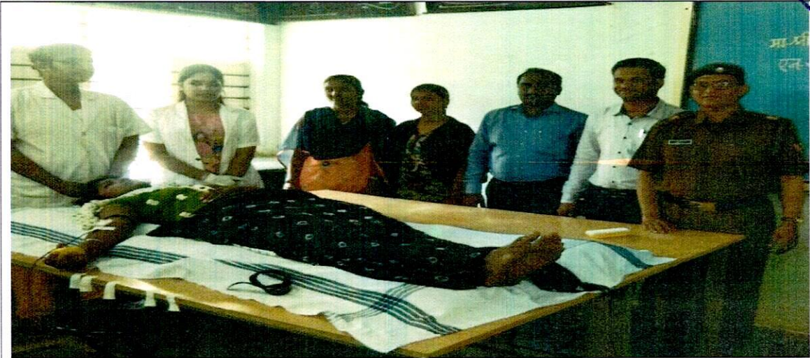
Students and faculty present while donating blood