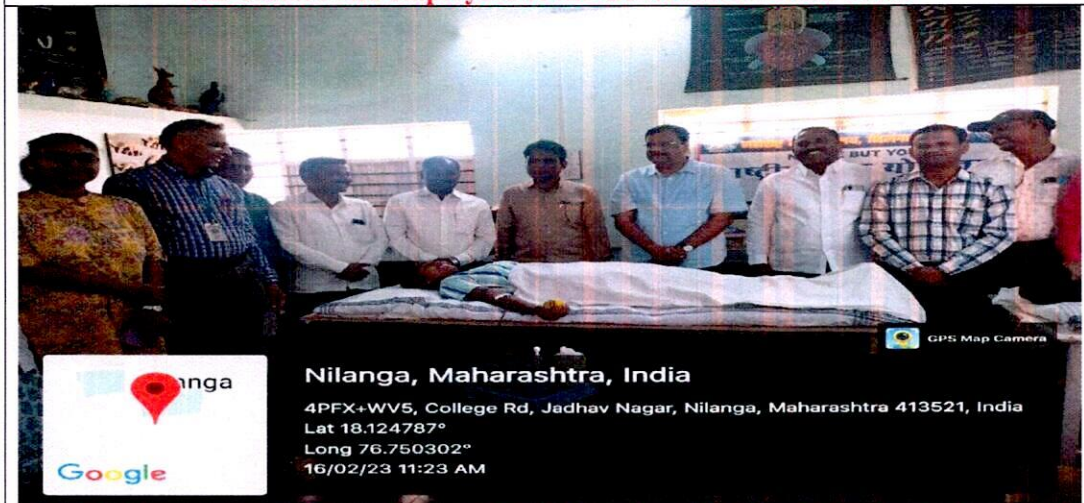
Hon'ble Vijaykumar Patil Nilangekar and other dignitaries present while welcoming the doctors and employees of the Government Blood Bank

Nilanga, Maharashtra, India 4PFX+WV5, College Rd, Jadhav Nagar, Nilanga, Maharashtra 413521, India Lat 18.124788° Long 76.750321° 16/02/23 11:17 AM