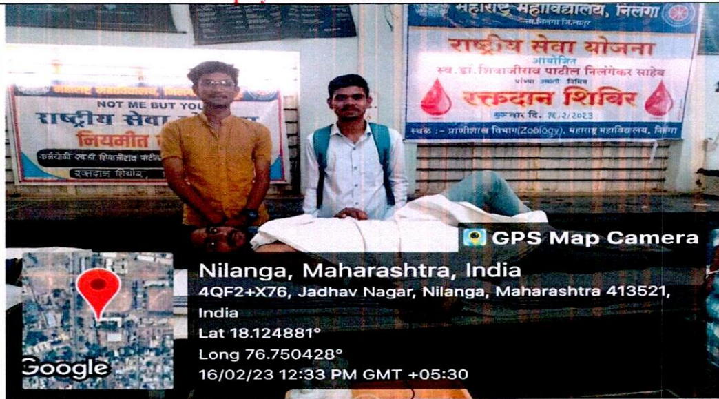
Dignitaries present during volunteer blood donation of National Service Scheme and employees of Government Blood Bank

Nilanga, Maharashtra, India 4PFX+WV5, College Rd, Jadhav Nagar, Nilanga, Maharashtra 413521, India Lat 18.124791° Long 76.750034° 16/02/23 12:33 PM GMT +05:30