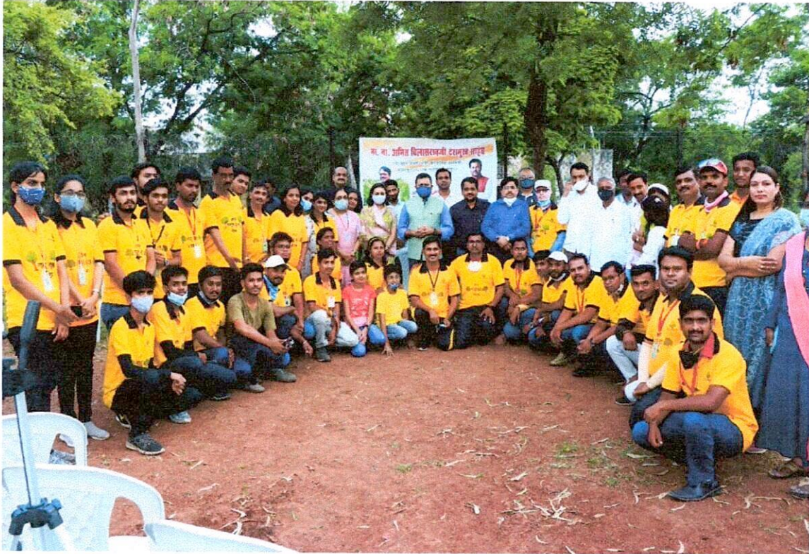
A moment after tree plantation