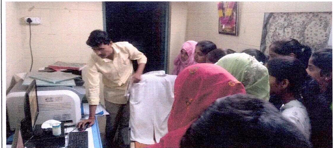
College students taking X-ray machine at Sub District Hospital Nilanga