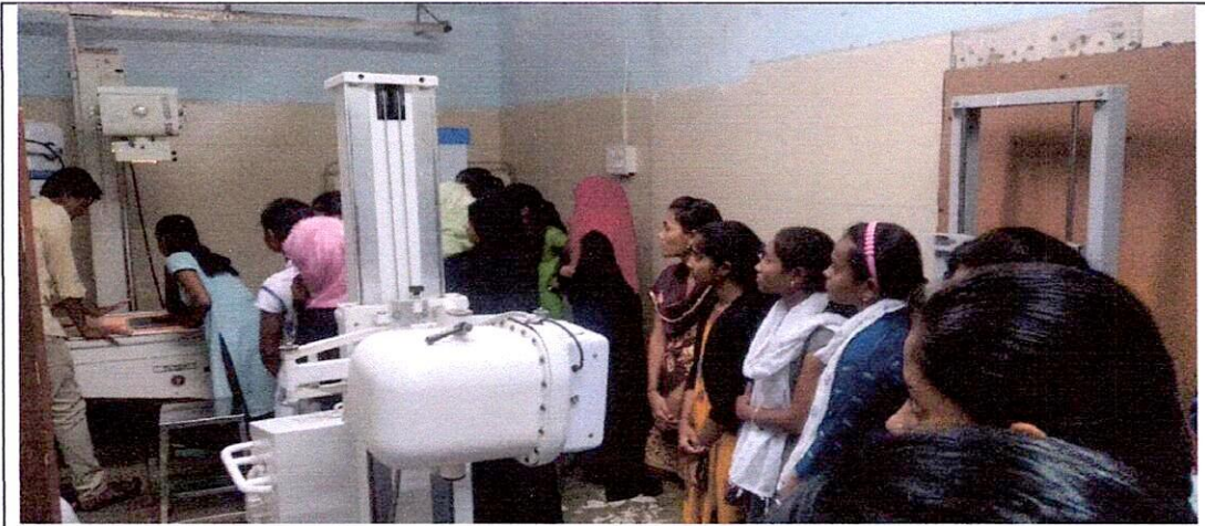
College students taking X-ray machine at Sub District Hospital Nilanga