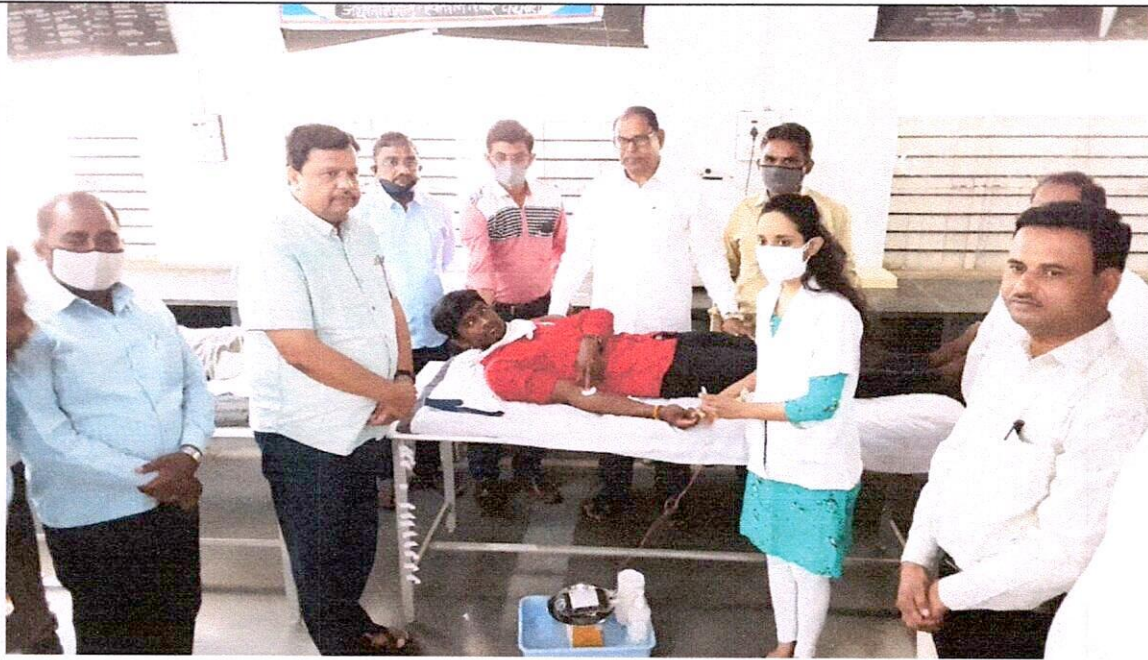
Students and staff of the college while donating blood