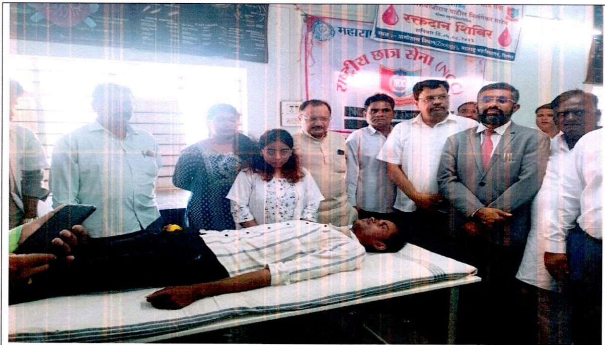
Volunteers of National Service Scheme donating blood under Blood Donation Camp and President of the organization Hon'ble Vijay Patil Nilangekar Sahib and other dignitaries.