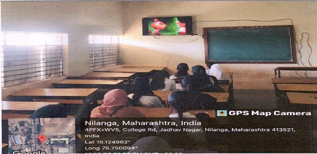
Screening of Drama on "Dharti Aabha" (Related to the Syllabus Content)