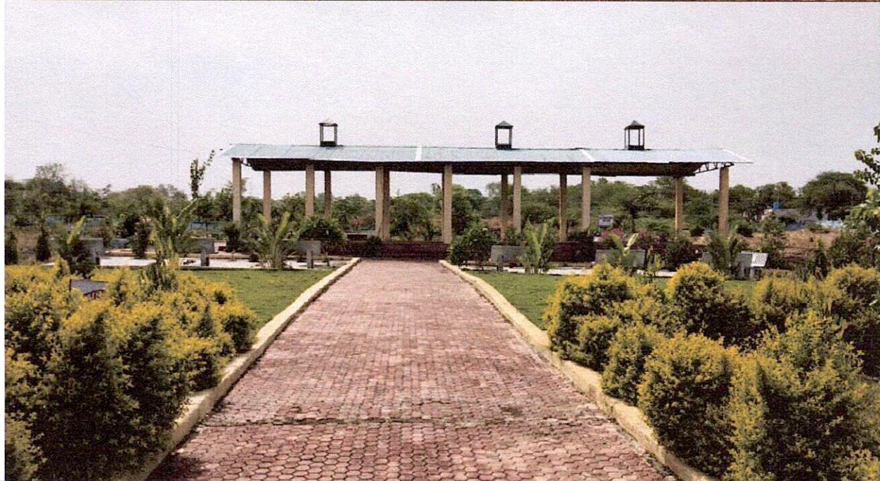
Photograph of Shantivan Crematorium after beautification is completed.