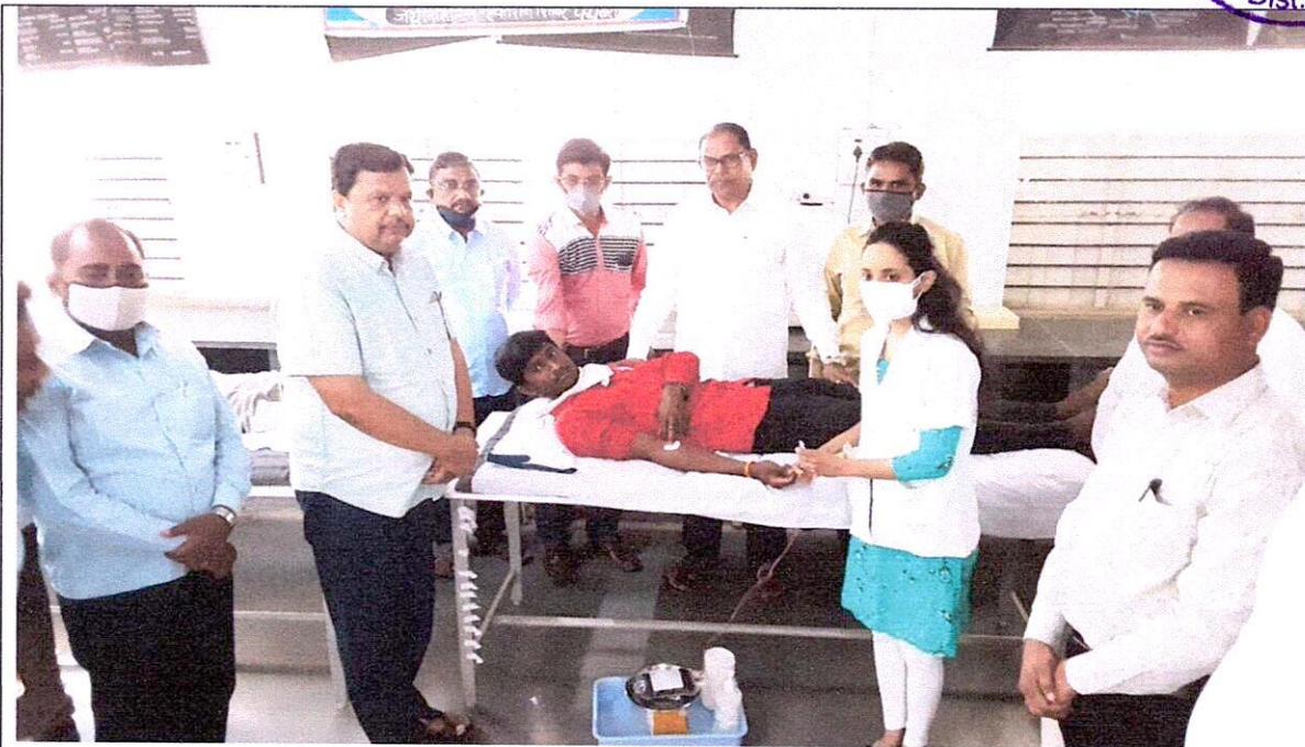
Students and staff of the college while donating blood