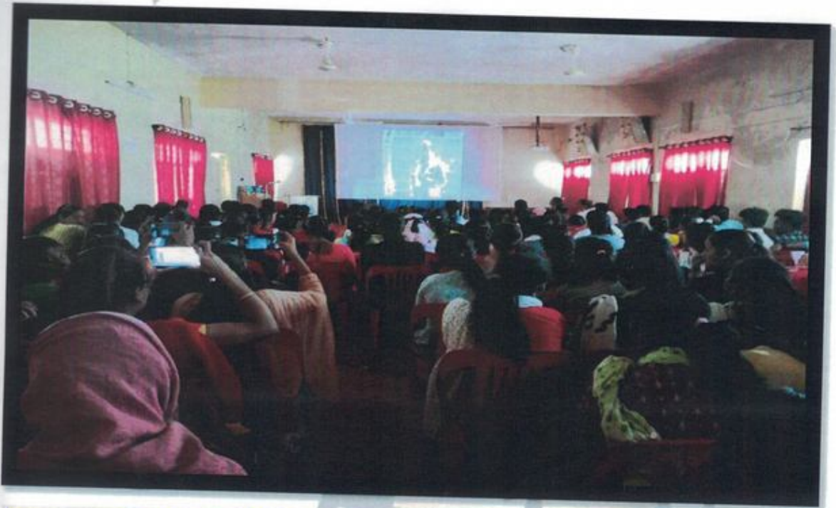
Students watching the short film "Taar" Date: 27/01/2023