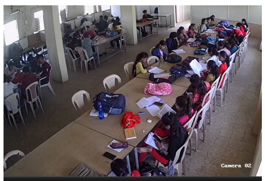
Girls Reading Room