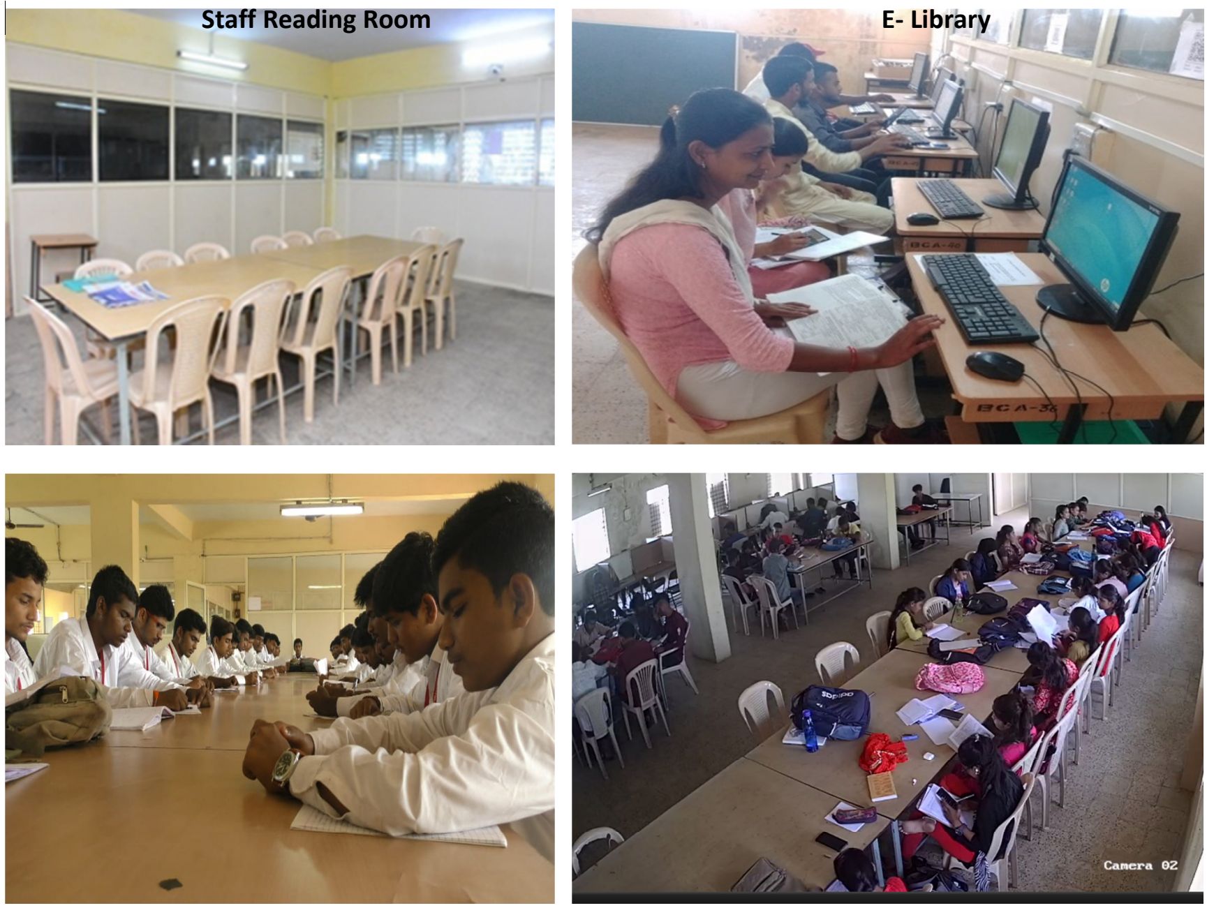
Boys Reading Room