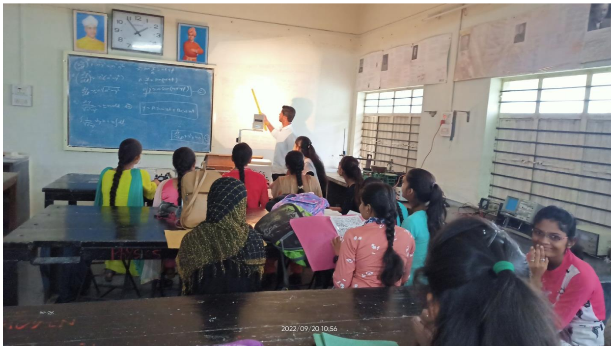
B.Sc. TY students on field visit : To study the X-Ray machine , its Uses in human disease diagnosis , at Govt. Hospital , Nilanga, on 31 st Dec-2022.