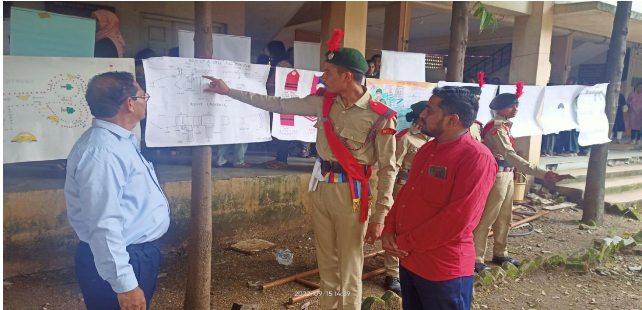
A student of B.Sc. while representing his Poster on 15 th Sept-2022.