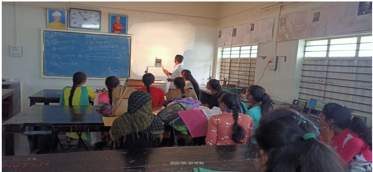
B.Sc. SY students while presenting their Seminars on OHP at Physics Dept.,MMN on 20 th Sept-2022.