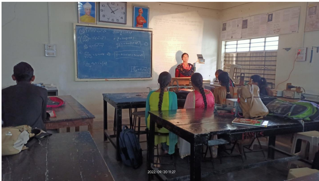
Students of class B.Sc. FY , are giving their Seminars on concerned topics using O.H.P. , On dated : 19 th Sept-2022.