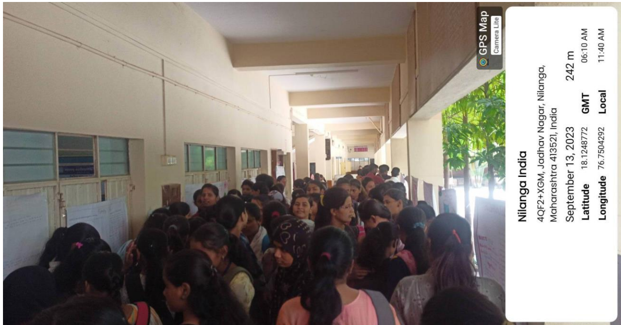
B.Sc. & B.C.A. students have crowded to see the Physics Poster demonstrations flashed on the wall's of the corridor on dated 13 th Sept-2023.