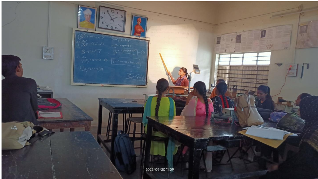
B.Sc. SY students while presenting their Seminars on OHP at Physics Dept.,MMN on 20 th Sept-2022.