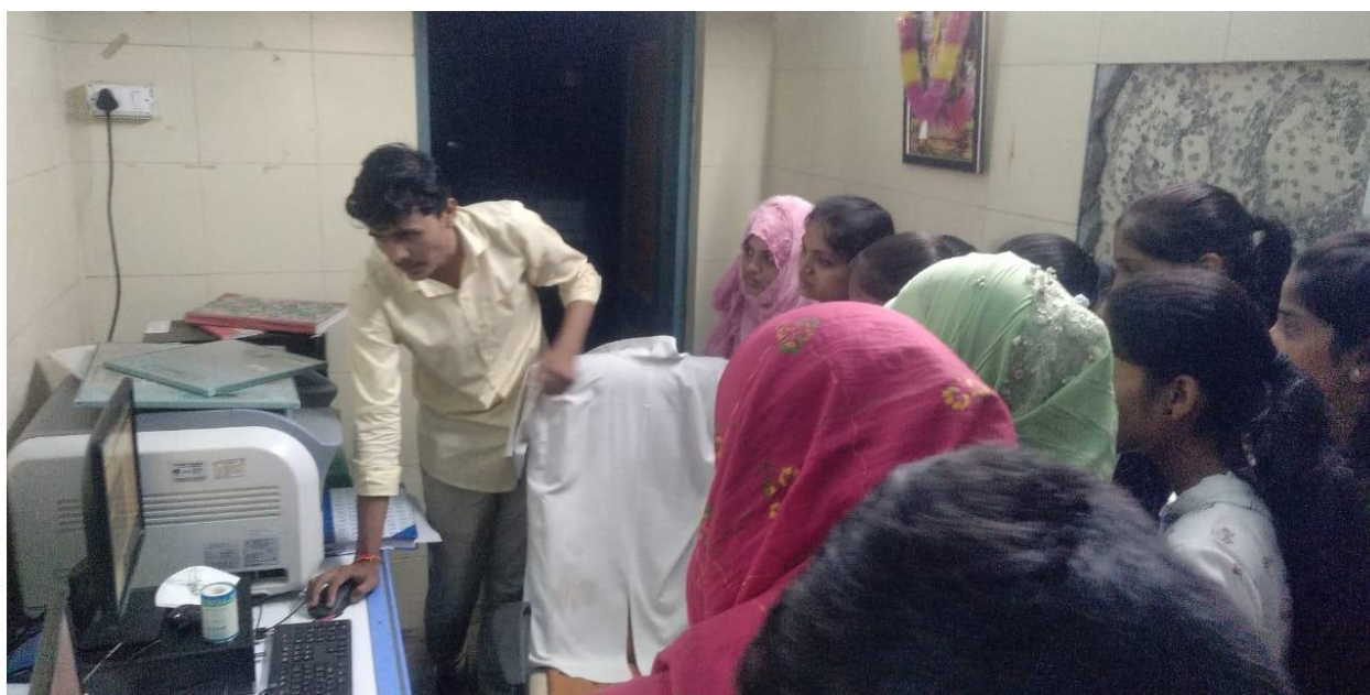
B.Sc. TY students on field visit : To study the X-Ray machine , its Uses in human disease diagnosis , at Govt. Hospital , Nilanga, on 31 st Dec-2022.