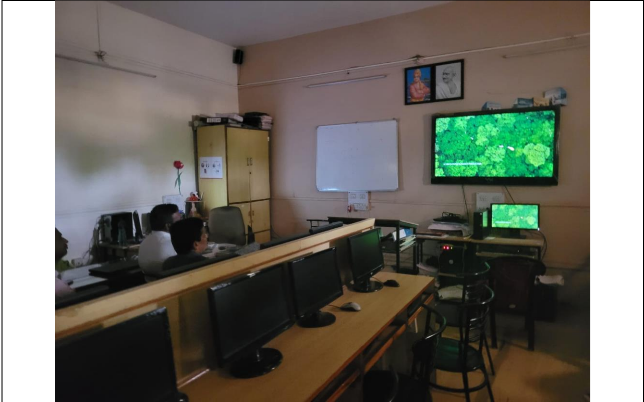
A special screening of the Oscar winning documentary The Elephant Whisperers