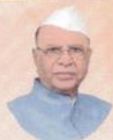
Our Inspiration Dr. Shivajirao Patil Nilangekar (Former Chief Minister of Maharashtra & Founder President, M.S.S. Nilanga)